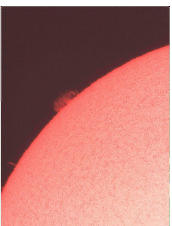
Solar Prominence by Hilton