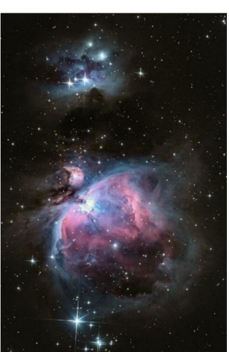
Orion Nebula by Craig