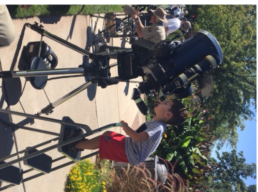
Solar Party Children's Museum