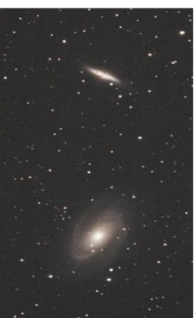
M82 M81 by Pete