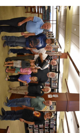
SGAG Presents Library with new Zhummell Horkheimer Telescope.